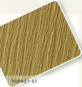
TOPAZA Δ 51