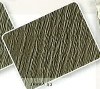
JAVA Δ 52