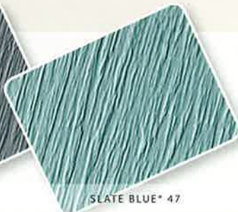
SLATE BLUE Δ 47