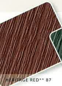
HERITAGE RED ** 87