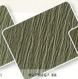
NUTMEG Δ 86