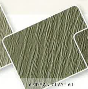
ARTISAN CLAY Δ 61