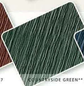
COUNTRYSIDE GREEN ** 88