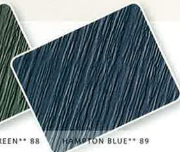
HAMPTON BLUE ** 89

Δ Premium color made with Armor Coat UVA™